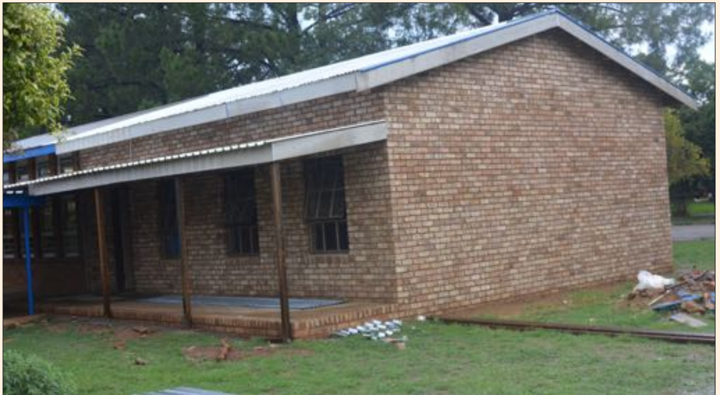
New additional block of classrooms constructed at Lichtenburg Primary School in Ditsobotla Sub-district Municipality.