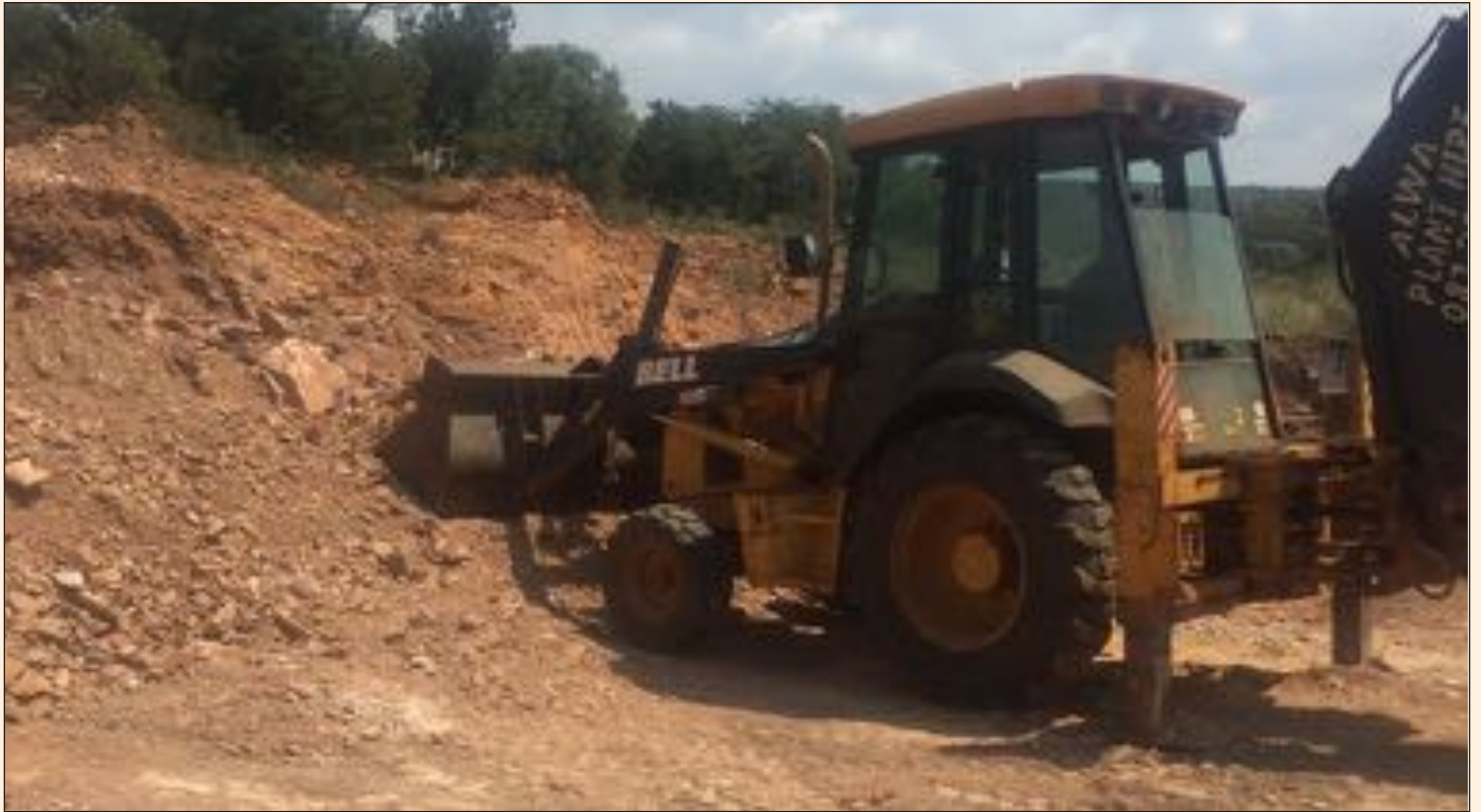
Gravel road from Khayakhulu is one of the roads in Bojanala District undergoing re-graveling to make them more trafficable.