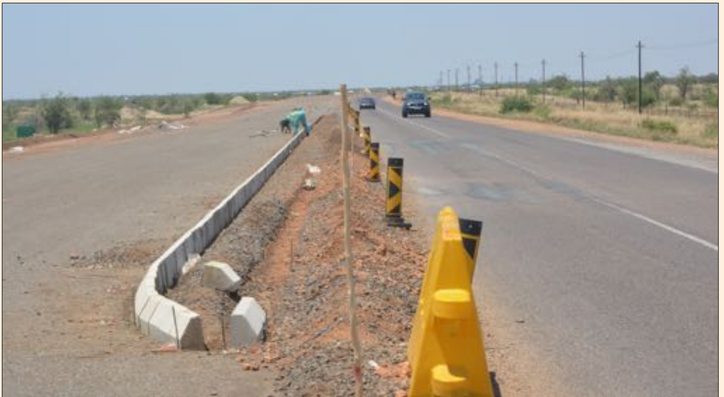
Constructed at the cost of R456m the dual carriage “Nelson Mandela Highway” is divided into three packages and currently a total of 14 sub-contractors and three suppliers have benefitted.