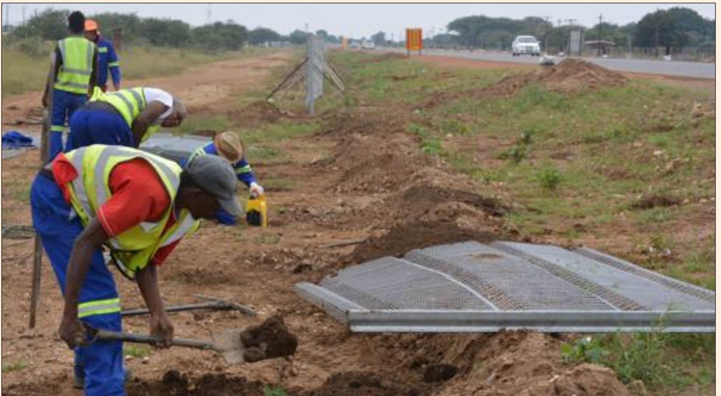
The erection of a security fence along the dual carriage “Nelson Mandela Highway” is currently underway. This is an effort keep away stray animals to reduce the number of fatalities on the road.