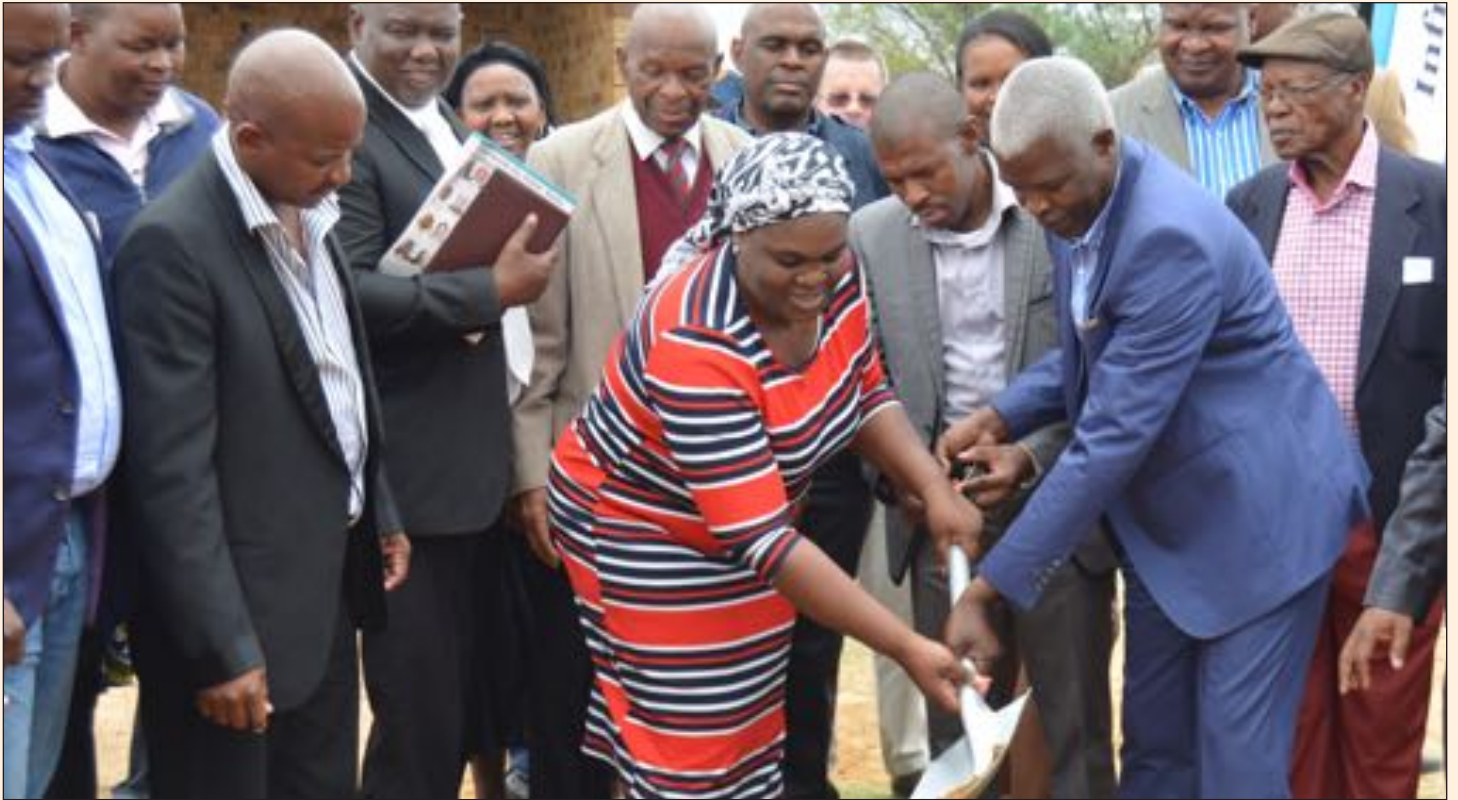
MEC Johanna Mmule Maluleke turning the sod to mark the beginning of the construction of a new road in Lebothwane village in Moretele Local Municipality. Progress on 5.1km road currently stands at 45% completion stage. The road connects the villages of Lebothwane, Tlholwe and Ga-habedi.