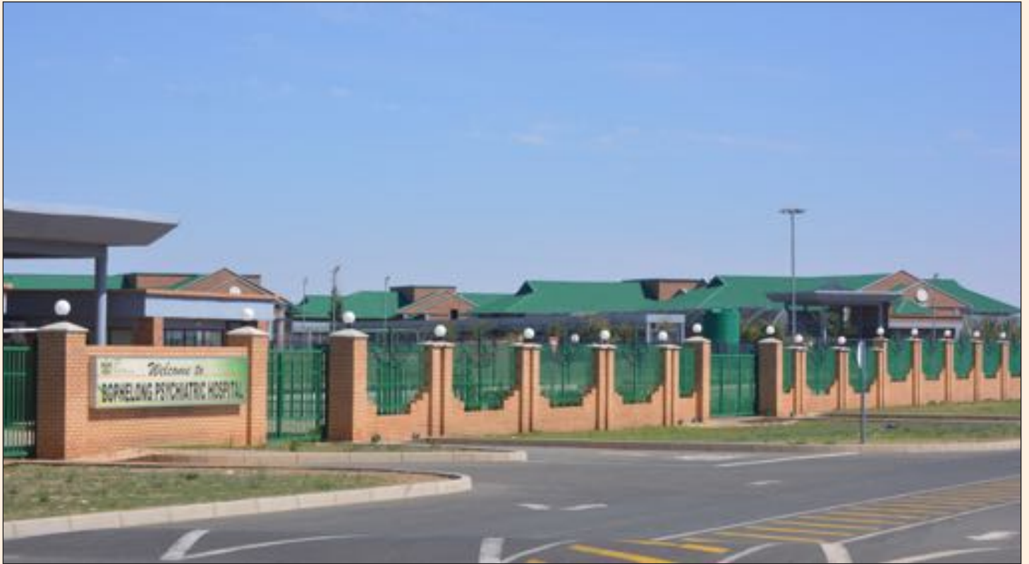
The newly constructed Bophelong psychiatric hospital, situated between Mahikeng and Rooigrond, is one of the government buildings recently donated to the department, adding to the list of properties for which the department has to pay for rates and taxes.