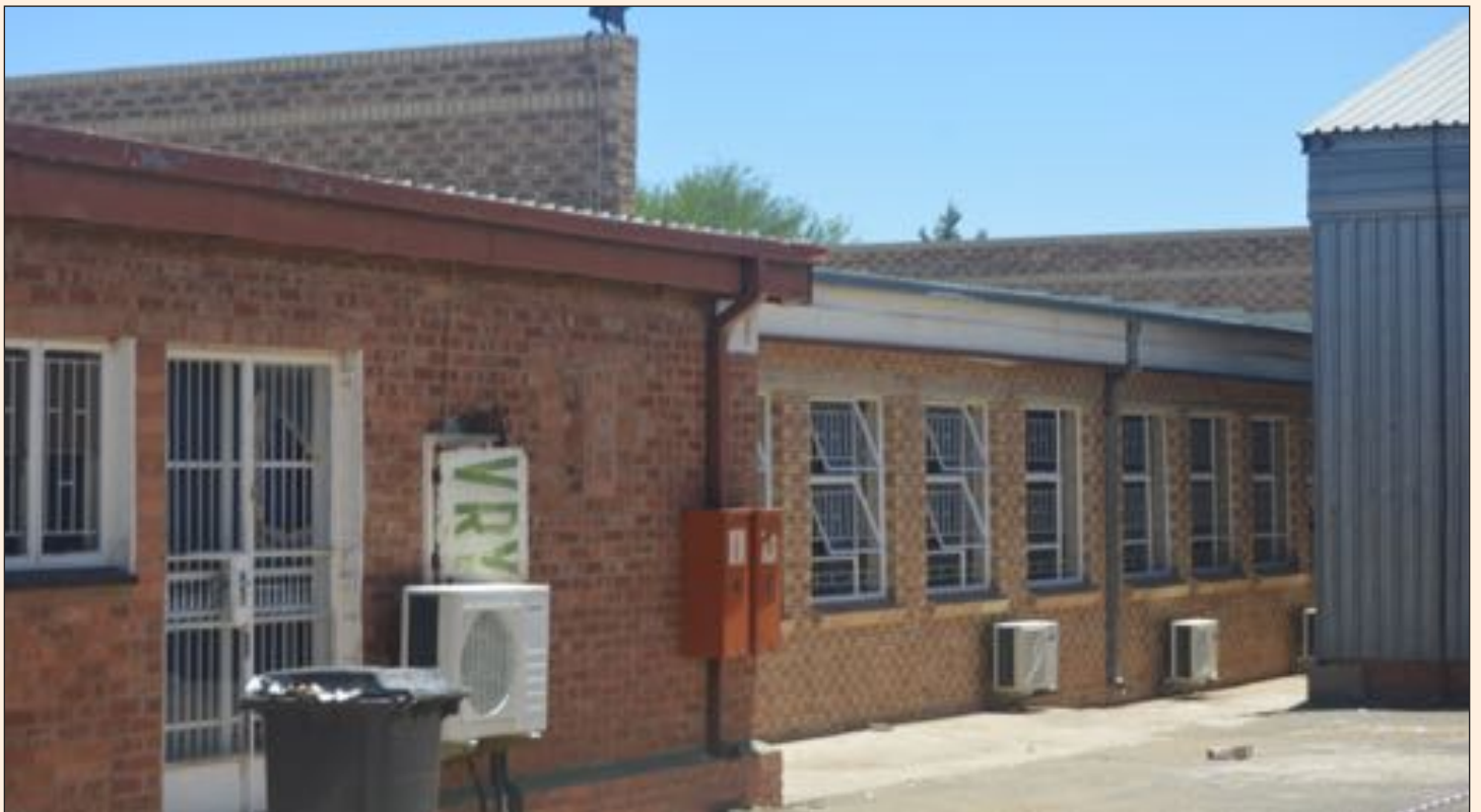
A section of the Dr Ruth Segomotsi District Offices in Vryburg currently undergoing renovation work to the tune of R5.8m. This is the first time this building receives a face lift since it was bought in 1997. This renovation project will also serve to boost morale of employees.