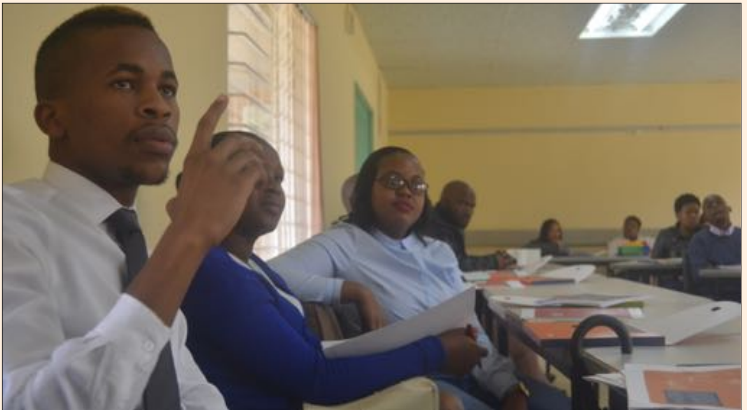
The 2017/2018 intake of interns received final training from the Ikatisong School of Government deemed necessary before they make their exit from the public service. The workshop is to prepare the interns for the world of work.