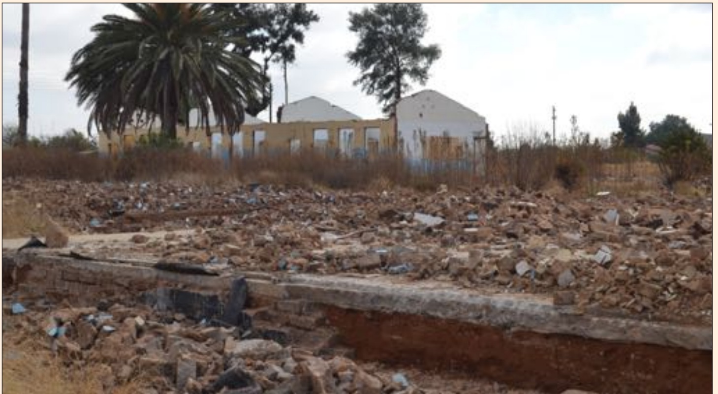
Reduced to a pile of rubble...What used to be Aobakwe Primary School in Itsoseng, Ditsobotla Local Municipality now lies in ruins after it was vandalised. This is not the only school in the province that this hideous fate befell, more schools have been vandalised.