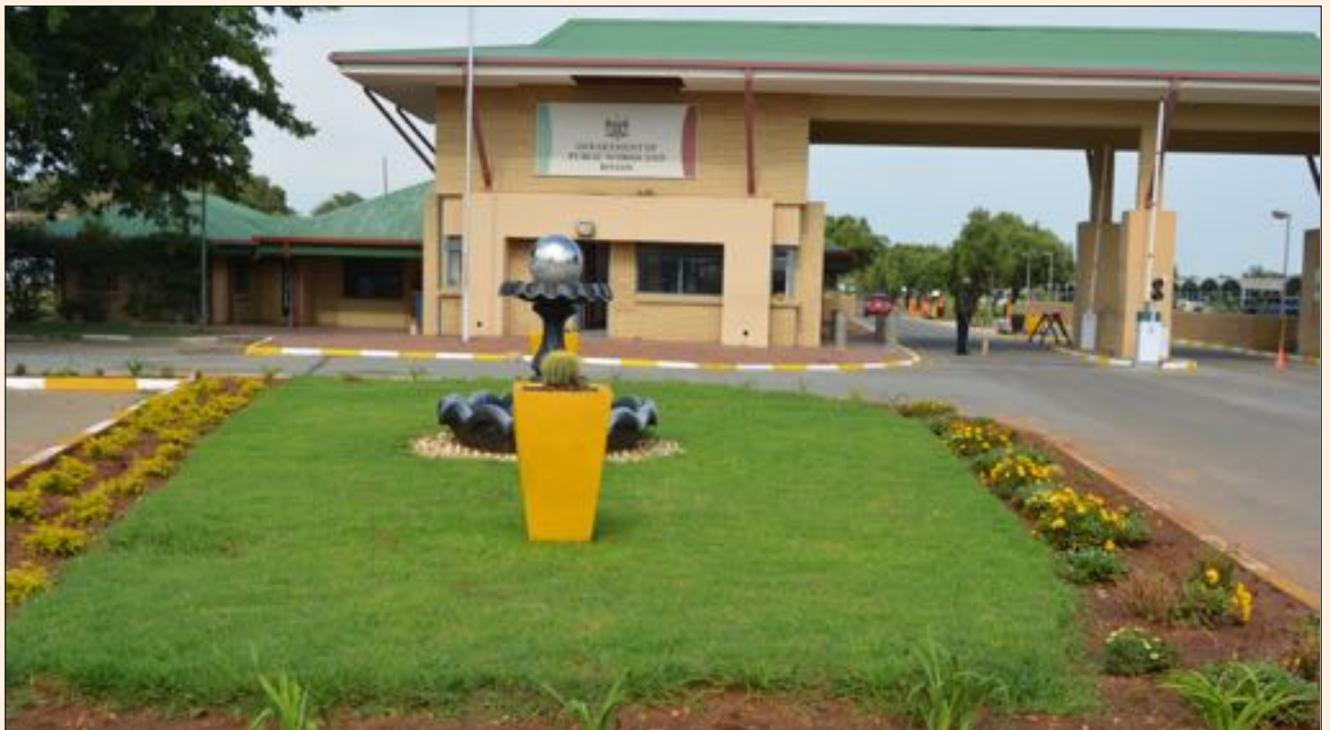
Entrance to the Old Parliament Complex is adorned with an array of flora to beautify the environment and improve the look of our provincial seat of government. This complex houses our department; Community Safety and Transport Management and national Department of Justice (Molopo Regional Court). Similar improvements are underway in various government precincts across Mahikeng.