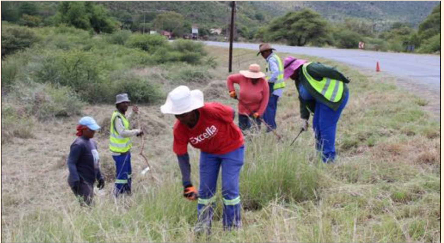
Part of the Itirele Road Maintenance Programme beneficiaries working on the road from Matooster to Bapong. The beneficiaries were pictured while busy with the felling of overgrown tree branches that obstruct views of the road as the area is frequented by stray livestock thus posing a danger to motorists.