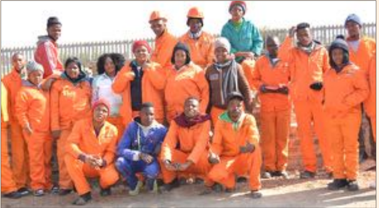
Some of the National Youth Services (NYS) beneficiaries were involved in the construction of the new Wellness Centre in Dr Kenneth Kaunda District. Construction of this facility served as practical training following their theoretical stint in the classroom that ended June 2017.