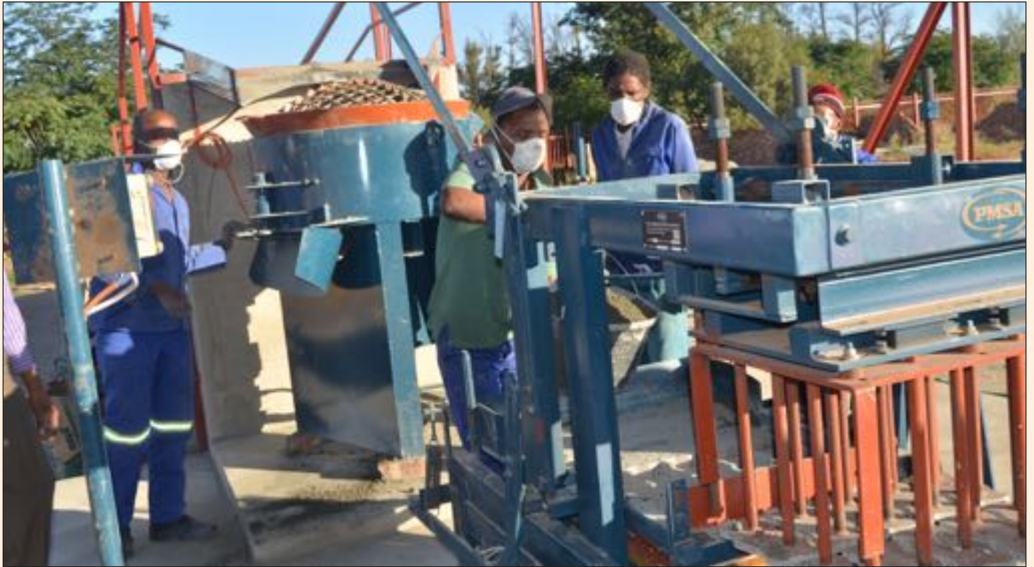
One of the brick-making plants in Christiana. The bricks produced on these plants will be used in government projects which will include construction of internal roads. A total amount of R48 million was dedicated to establishing brick-making plants in all of our four districts. 1000 job opportunities are expected to be created when all plants are established.