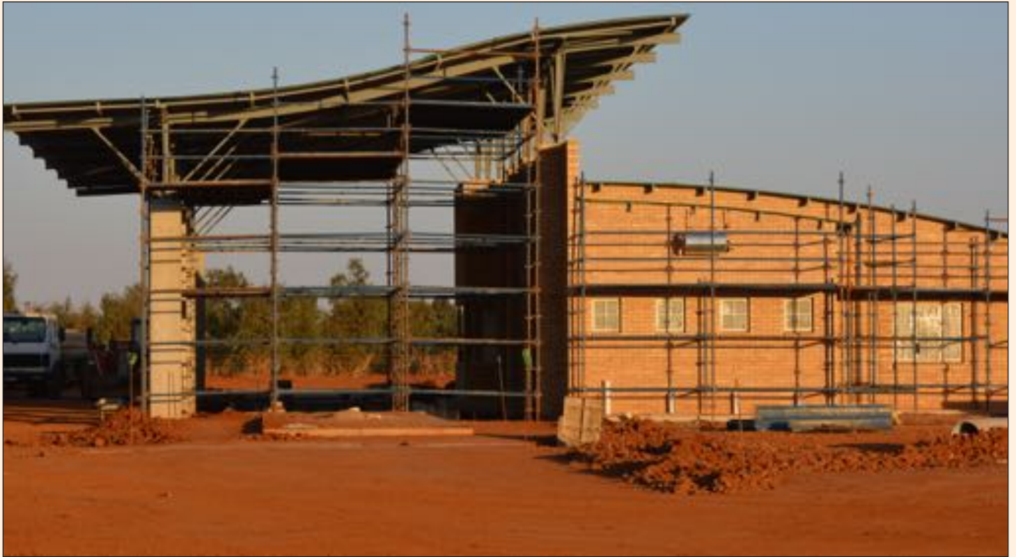
Work in progress...Construction work on the R35m Lichtenburg Weighbridge is almost complete. Weighbridges are used to weigh entire vehicles and their contents to avoid over loading which has a resultant effect on the life span of our roads.