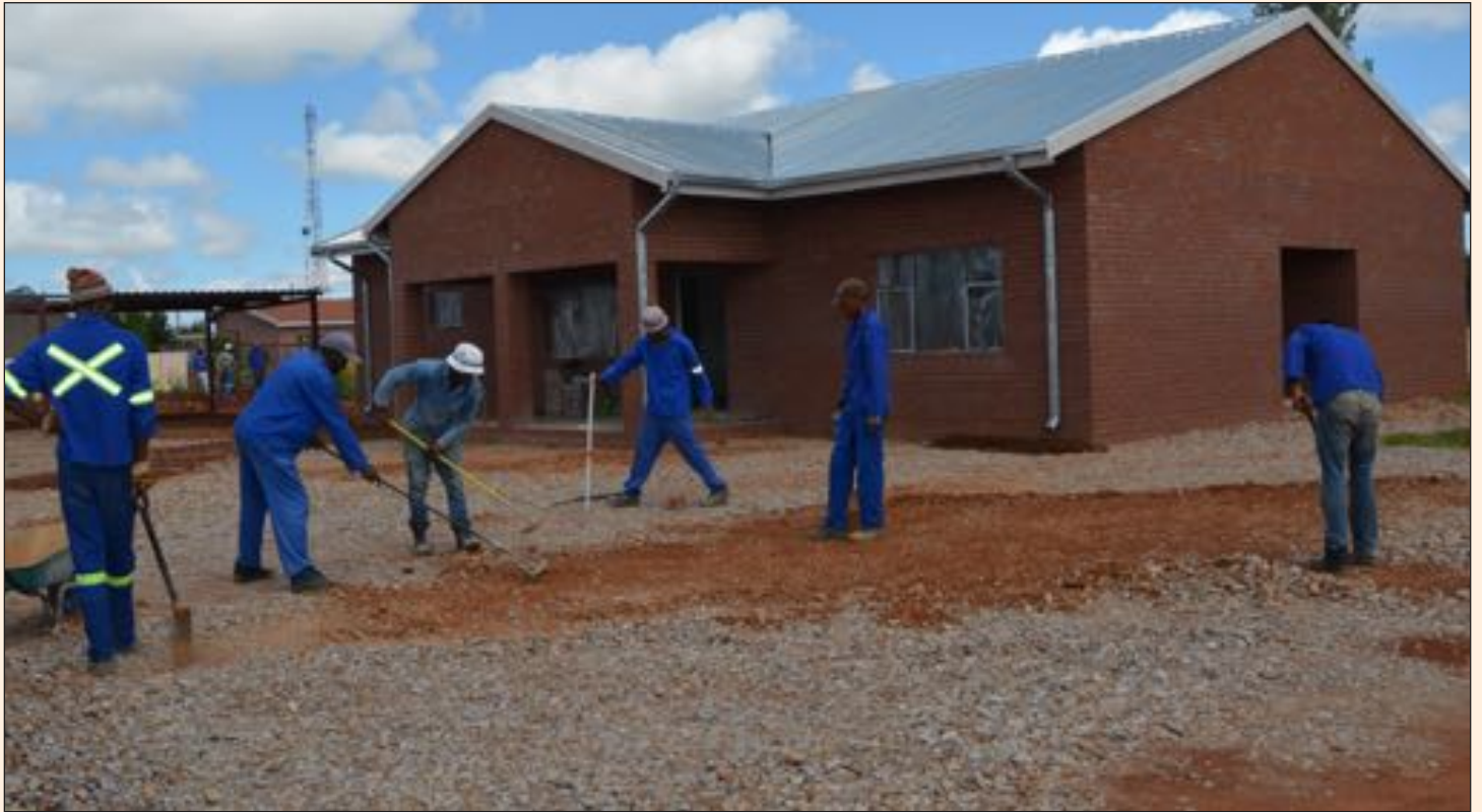
construction work drawing to close at the new Atamelang Sub-district offices in Ngaka Modiri Molema District. This office building project awarded to a woman contractor, has progressed well and on schedule. The quality of workmanship is also satisfactory.