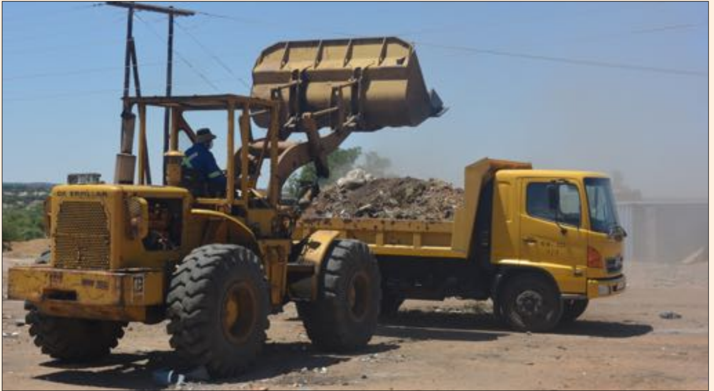
The department participating in the Setsokotsane 10 x 10 campaign at Ipelegeng township in Mamusa Local Municipality. Illegal dumping sites were cleaned, internal roads graded and potholes on the Ipelegeng to Amalia road were patched.