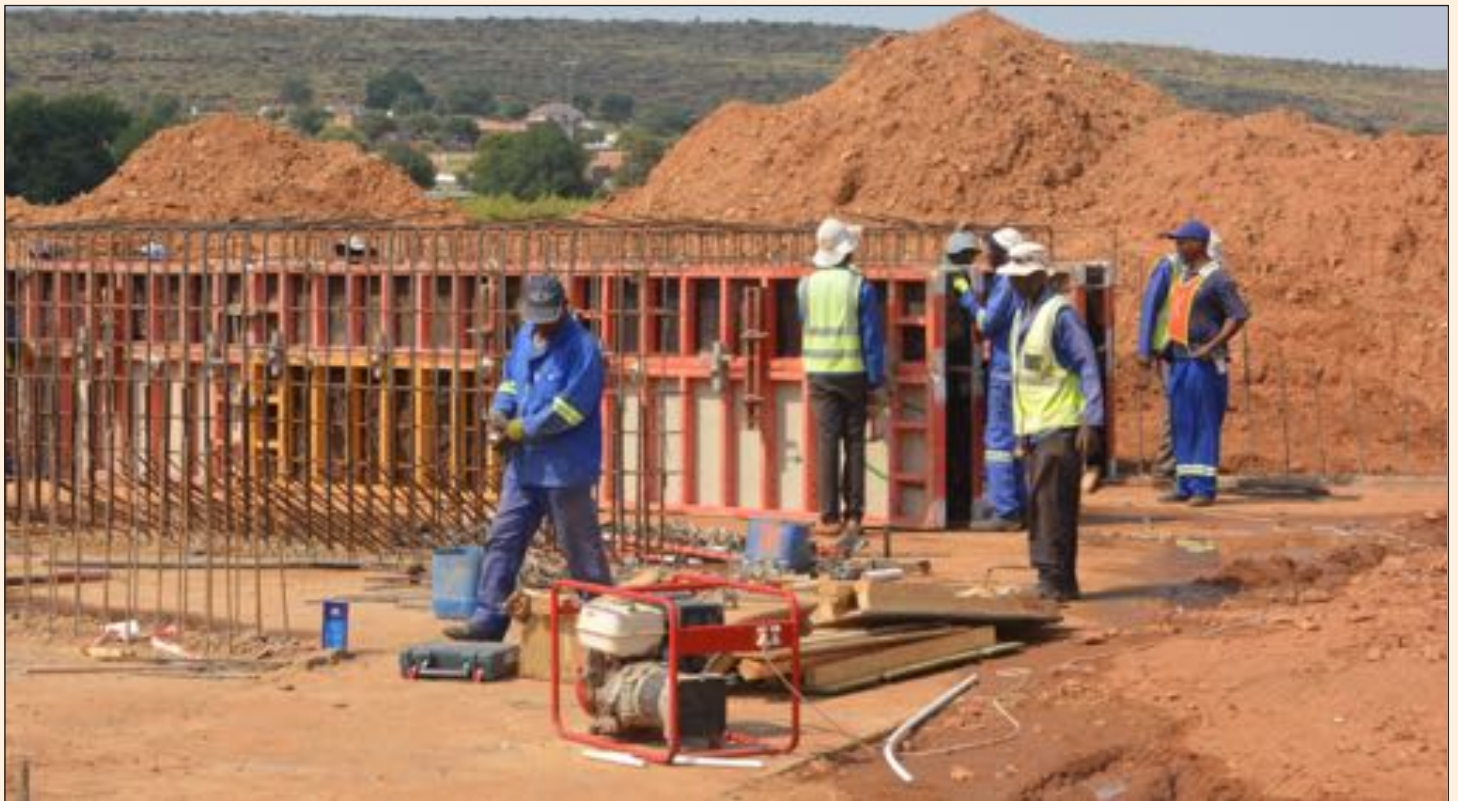
Upgrading of 21.7km of Road D221 from Maphoitsile to the end of tar in Magogong in Taung, Dr Ruth Segomotsi Mompati currently stands at 55% completion stage.