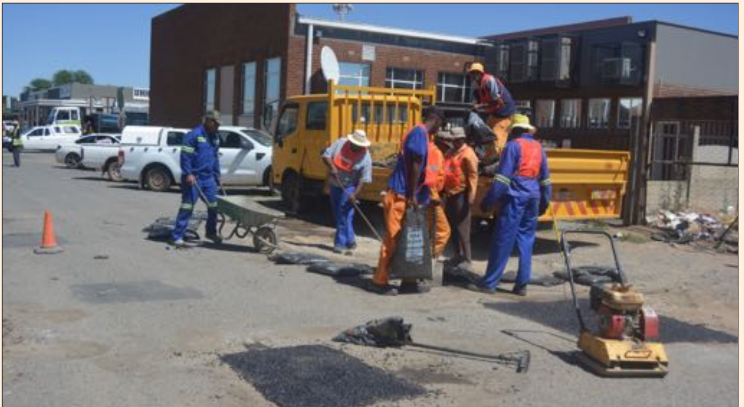
Pothole patching in Delareyville in Tswaing Local Municipality, Ngaka Modiri Molema District as part of Setsokotsane 10 x 10 campaign.